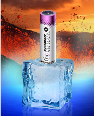
Industrial grade TLI Series rechargeable Li-ion batteries operate up to 20 years and 5,000 recharges, delivering high pulses and an extended temperature range.

Consumer grade rechargeable Li-ion batteries are ill suited for long-term deployments in extreme environments due to a gradual degradation of the cathode, making them less receptive to future recharging, which reduces their potential lifespan. Consumer grade Li-ion batteries also have other drawbacks, including a high self-discharge rate and a relatively narrow operating temperature range.