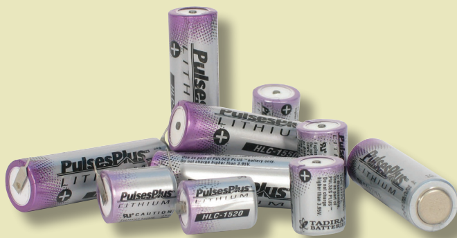
3. Tadiran's PulsesPlus batteries utilize a patented hybrid layer capacitor (HLC) to deliver the high current pulses required for advanced two-way communications.

ing techniques can lead to uneven battery performance. This includes batch-to-batch inconsistencies that raise the risk of anomalies in the field, even if initial performance characteristics seem identical. As a result, advanced manufacturing processes based on Six Sigma and statistical process control (SPC) methodologies are required to ensure consistent product quality.