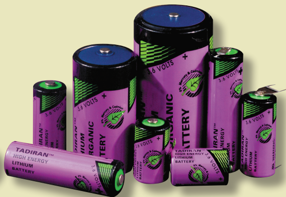
4. Tadiran's TRR series batteries don't need an HLC but can deliver moderate current pulses without voltage or power delay.

One alternative is to combine supercapacitors with lithium cells, a solution that tends to fail prematurely due to relatively high self-discharge. A supercapacitor comprising dual 2.5-V capacitors also needs a balancing circuit to ensure acceptable